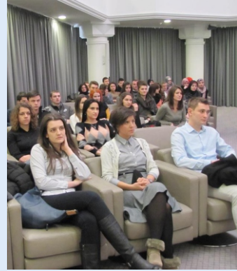
SUPPORT YOUTH IN B&H IN EDUCATION AND SCIENCE