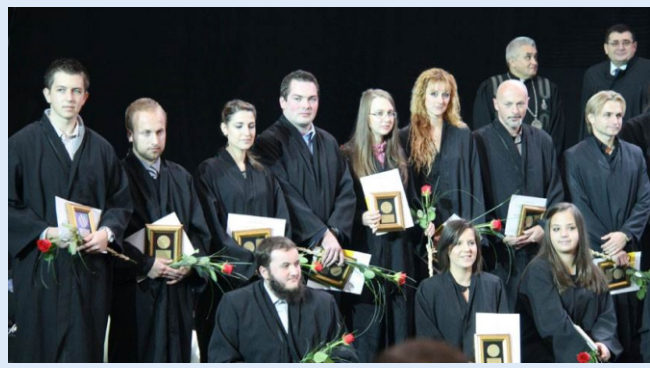
The scholarship holder's average grade is 9.51 in 2015/16.