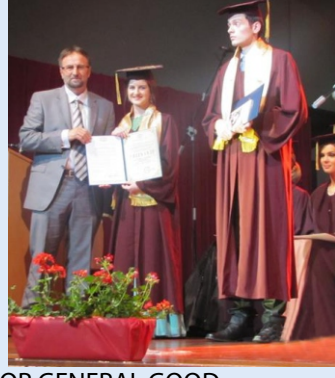
GIVE YOUR GOOD FOR GENERAL GOOD