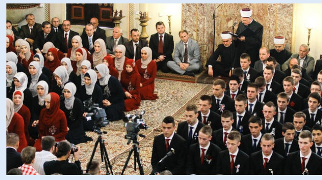
"The knowledge is your lost matter, wherever you find it, take it."