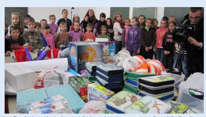
Our help included over 1,700 students returnees in Republic Srpska