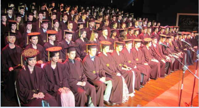
"Education is the golden key to freedom and success."