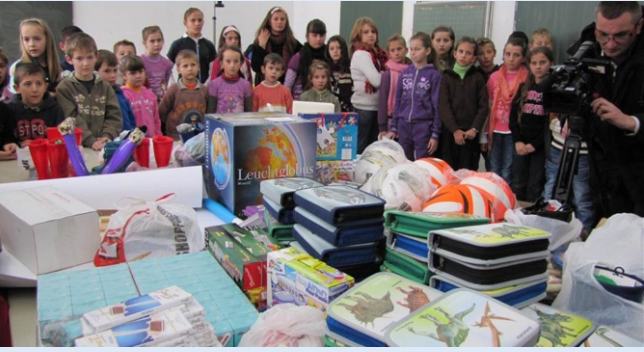
Our help included over 1,700 students returnees in Republic Srpska