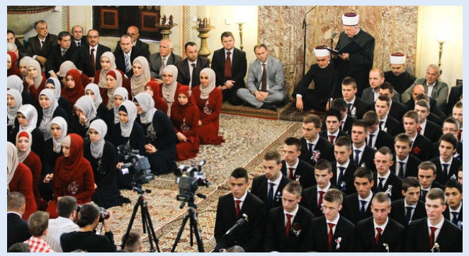
"The knowledge is your lost matter, wherever you find it, take it."