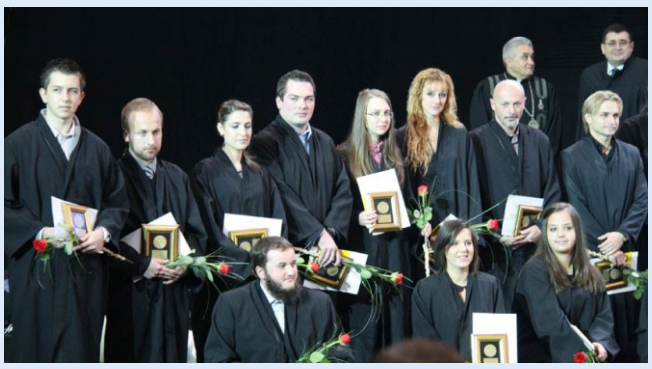
The scholarship holder's average grade is 9.51 in 2015/16.